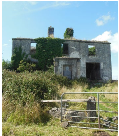
Right: The Rising in east County Galway ended at Limepark House on Saturday 29 April 1916.

A conference on the theme of Farming and Country Life 1916: Centenary Celebration will be run by Teagasc and Galway County Council, in partnership with farming organisations and local communities. The event will demonstrate changes in farming and country life from 1916 to 2016. It will also showcase land and landownership, mechanisation, livestock, farm family and rural life, food and craft, as well as a changing heritage landscape. Staff from the Department of Heritage and Tourism, GMIT will contribute to the academic strand, which will feature heritage talks and a hedge school. Staff from the National Centre for Excellence in Furniture Design and Technology in GMIT's Letterfrack Campus will host an exhibition, featuring an assemblage of wood-turned items and other displays.