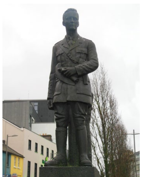
Above: This statue of Liam Mellows, who led the Rising in east County Galway, was erected in Eyre Square, Galway in 1957.